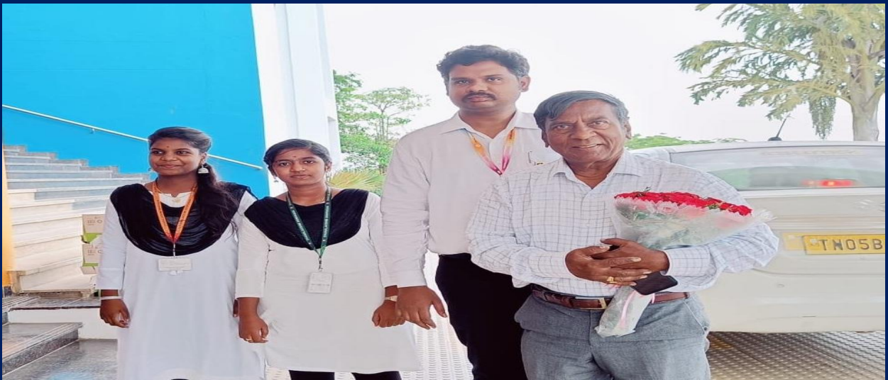
Welcoming Chief Guest