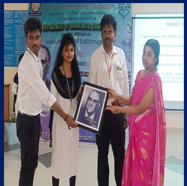
Presented by III BME students of 2020 to 2024 Batch