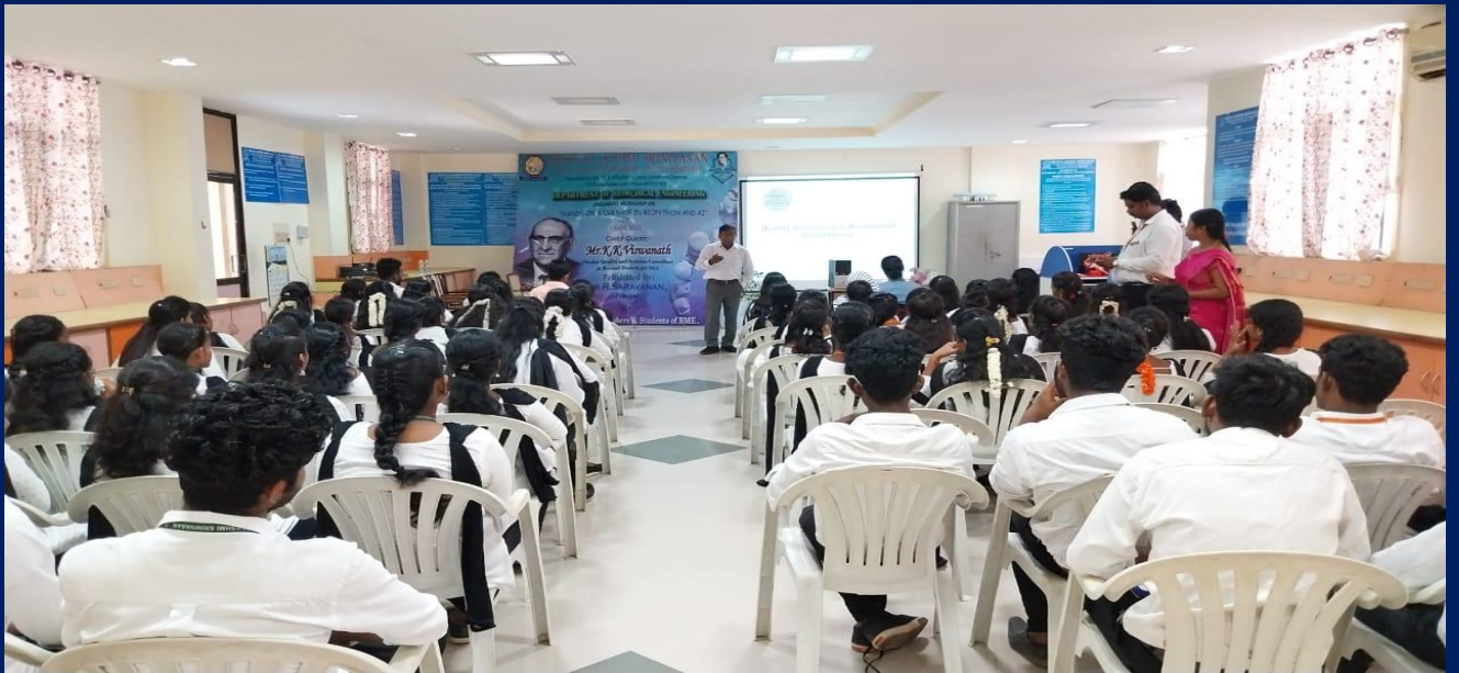
Chief Guest Speech