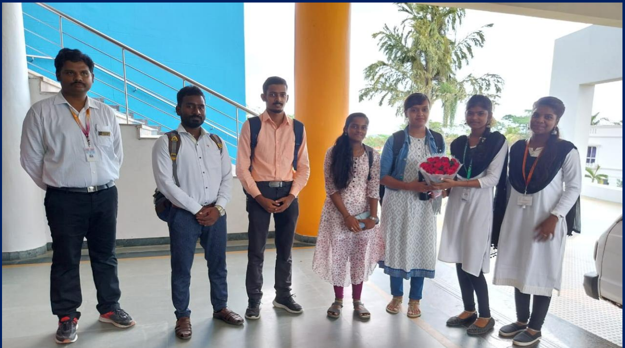
Welcoming Resource Persons