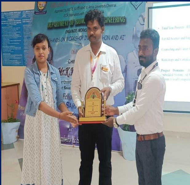
Memento given by Deepam Hospital