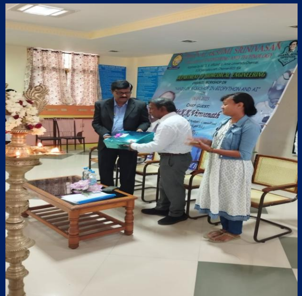
Gift given to the Chief Guest